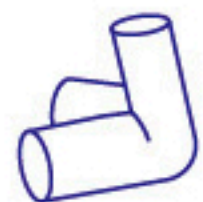
(A1) 1 pcs