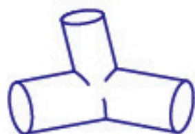
(A2) 1 pcs