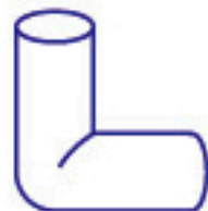
(G) 2 pcs