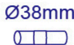
(E) 2 pcs

PLEASE NOTE THAT EACH JOINT HAS A SPECIFIC CODE.