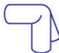
(B1) 1 pcs