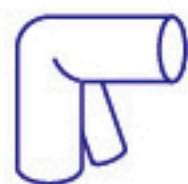
(B2) 1 pcs