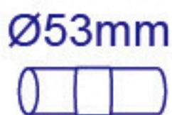
(F) 4 pcs

PLEASE NOTE THAT EACH JOINT HAS A SPECIFIC CODE.